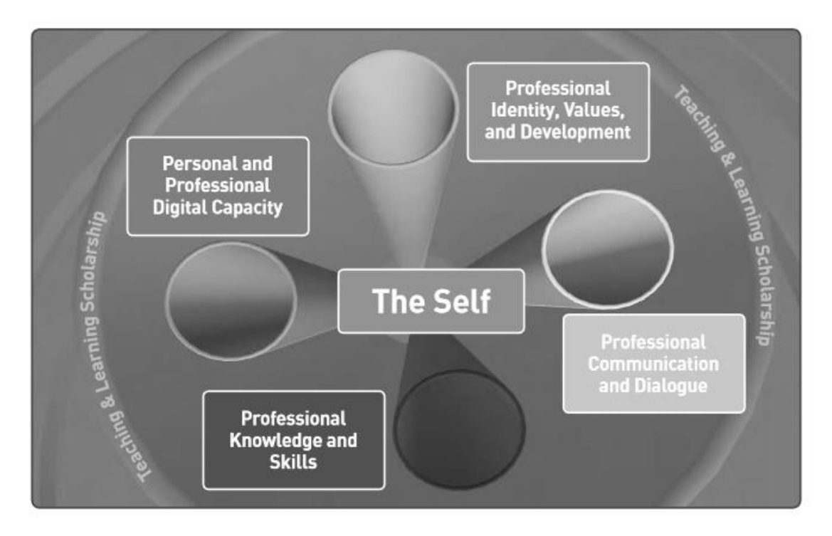
Figure 2: The national professional development framework for all staff who teach in Higher Education

The below graphic illustrates the five domains of for the professional development of teaching staff in HEIs identified by the National Forum.